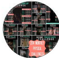
2014 Fitness Challenges