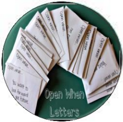
Open When Letters